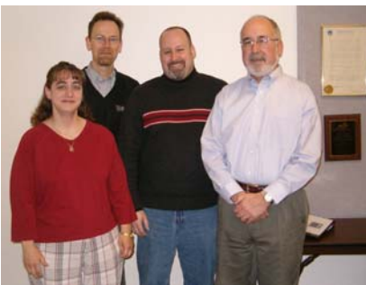
MAAC Appreciates the contributions of its Board of Directors.