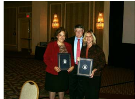
MAACLink and ROSIE HMIS software systems received an award from the U.S. Department of Housing and Urban Development